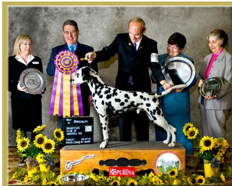
MBIS MBISS Ch. TCJ N Satin's Star Appeal