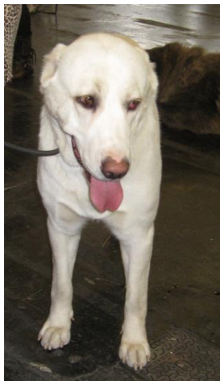
Central Asian Ovcharka

Monday October 10 th Columbus Day 7:30 PM